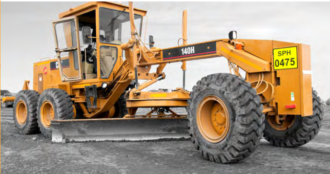
Haul Road Construction