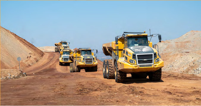
Open Cast Mining