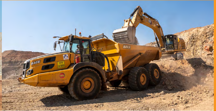
Loading & Hauling