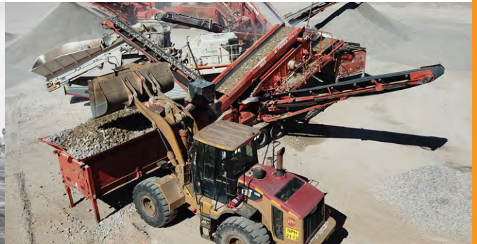
Crushing & Screening